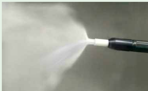
NORMAL GUN WITHOUT SIEVING - MILD STREAKING

The finish is substantially superior. Complex shapes are easily coated. Overspray is reduced.