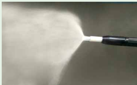
NORMAL GUN WITH EXTERNAL SIEVED POWDER - ALTERED CLOUD PATTERN