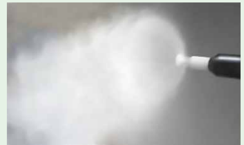
GUN WITH RTS (Patent No.311783) CONSISTENT UNIFORM PATTERN